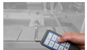
Play detector with remote control