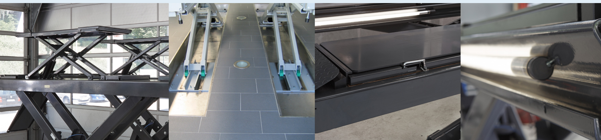
PLUS AMS VERSION (above ground installation): with wheel free lift + wheel alignment set + optional Axle Jack