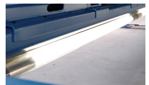
Lighting 4 or 6 tubes, fluorescent or LED