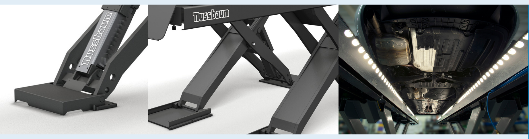
No fixed connection between the scissors